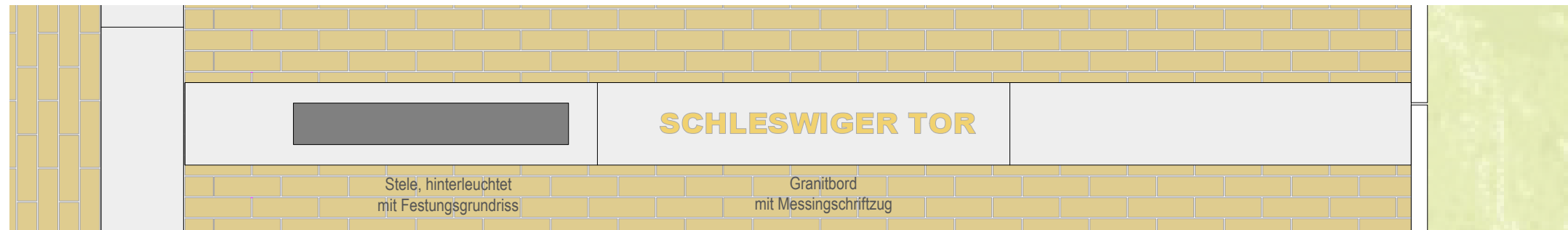
Aufsicht 1 : 20